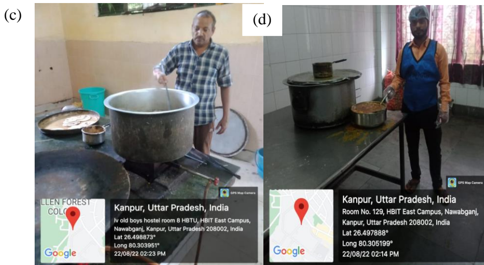
(a) Student eating in the mess in boys Hostel (b) Weekly menu for students (c) & preparation of foods