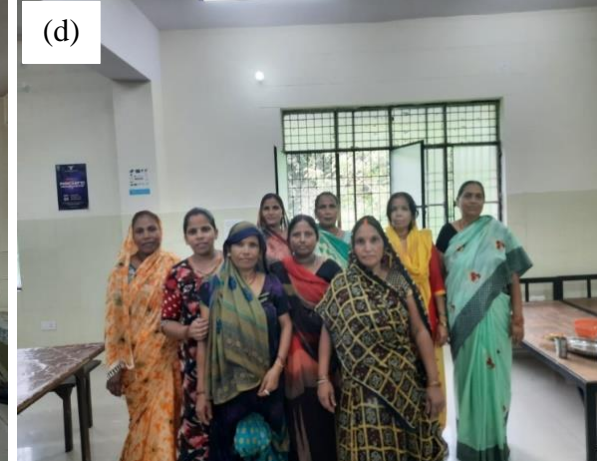
(a) & (b) Student eating and taking food in the hostel (c) preparation of foods (d) Team of staff members cooking food in the mess.